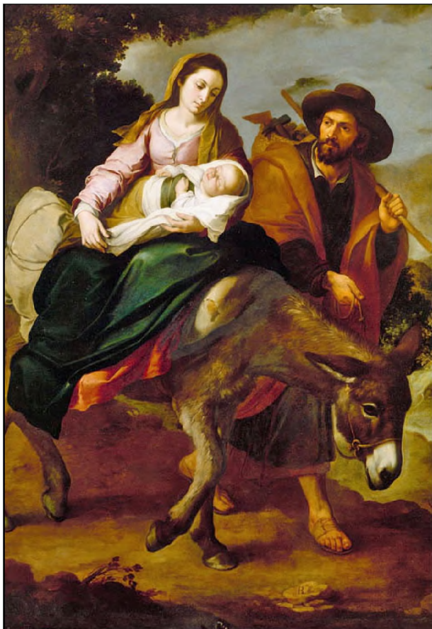
THE FLIGHT INTO EGYPT