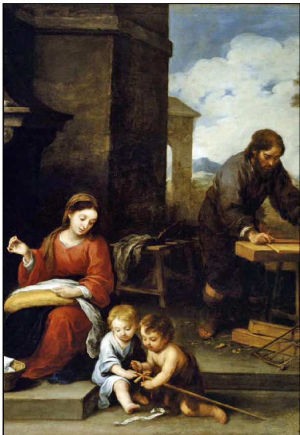
THE HOLY FAMILY WITH THE INFANT ST. JOHN THE BAPTIST