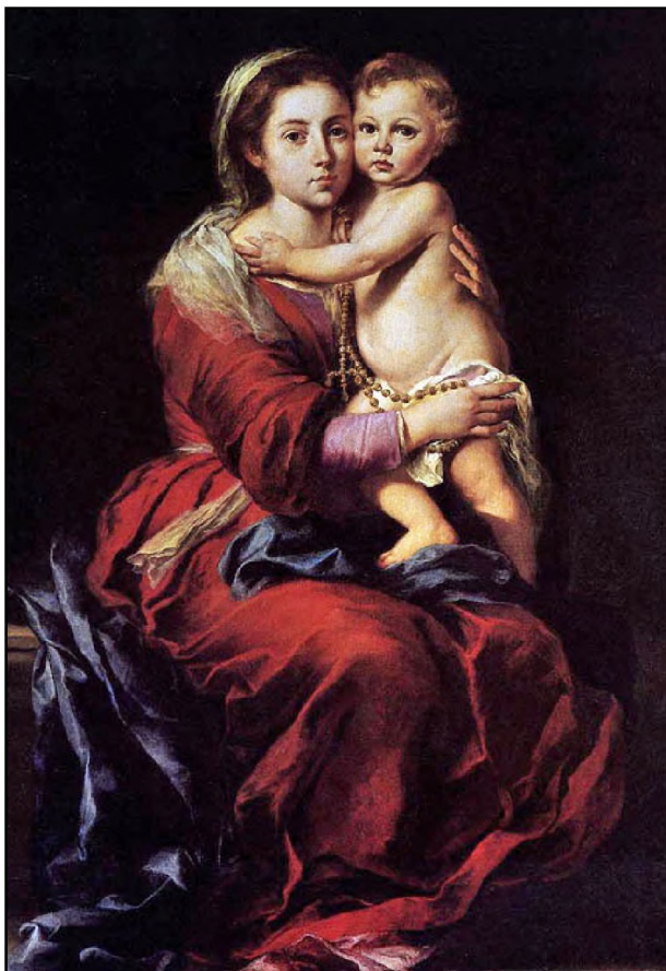
VIRGIN AND CHILD WITH A ROSARY