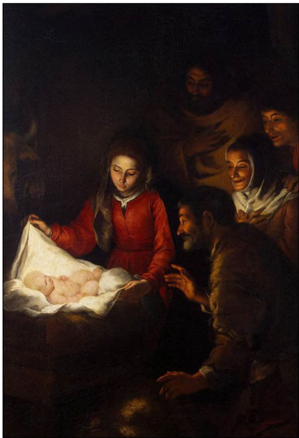
ADORATION OF THE SHEPHERDS