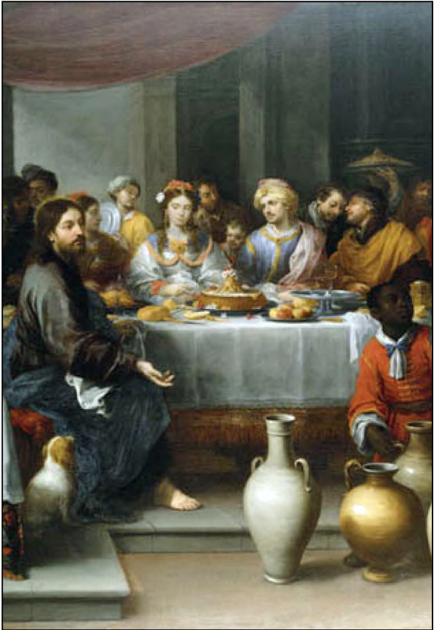
THE MARRIAGE FEAST AT CANA