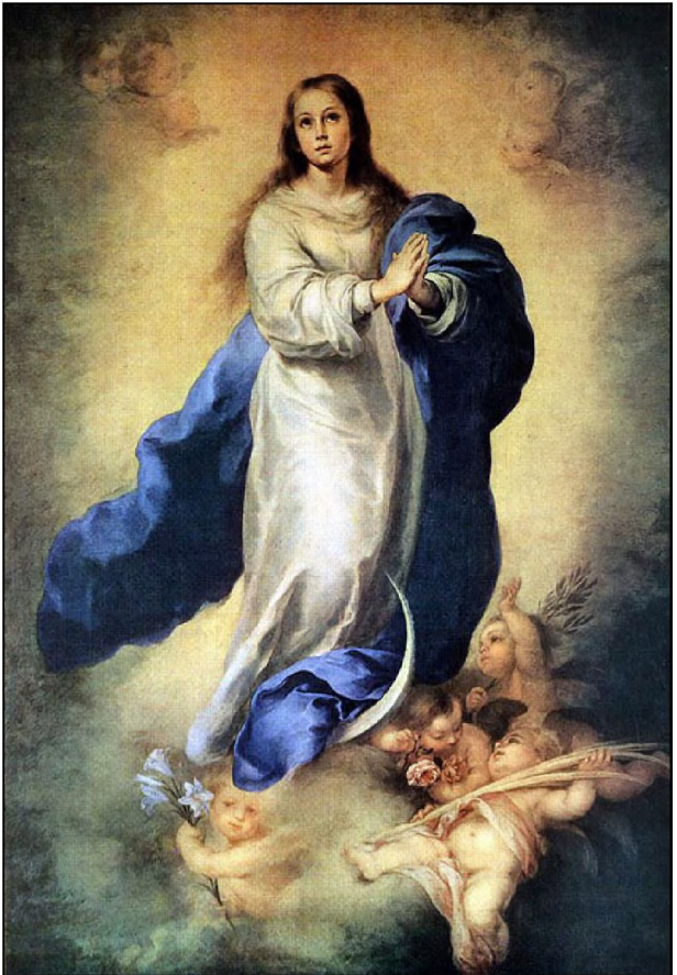
THE IMMACULATE CONCEPTION