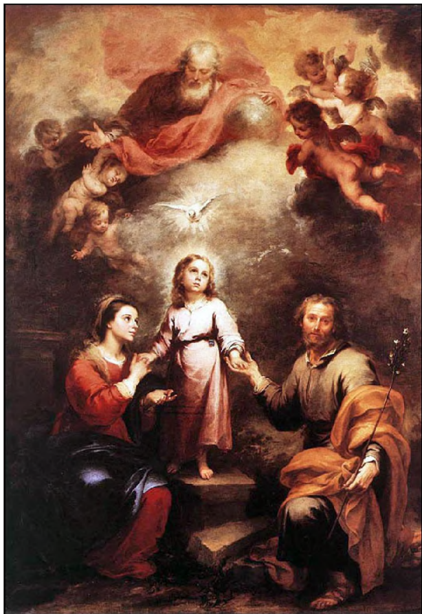
THE TWO TRINITIES