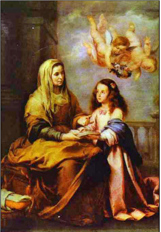
CHILDHOOD OF THE VIRGIN MARY