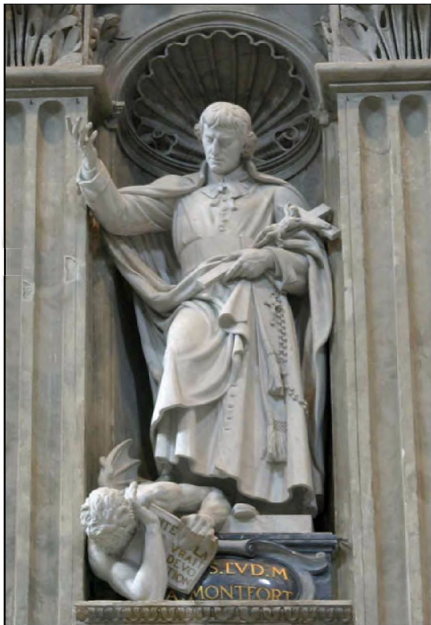
SAINT LOUIS-MARIE GRIGNON DE MONTFORT